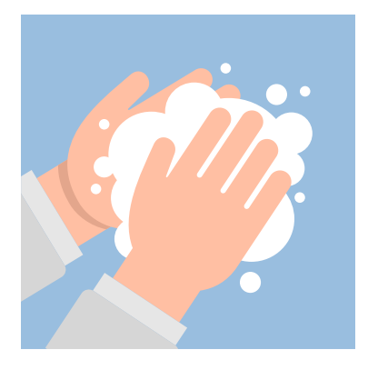
Wash your hands with running water and soap before entering the church hall