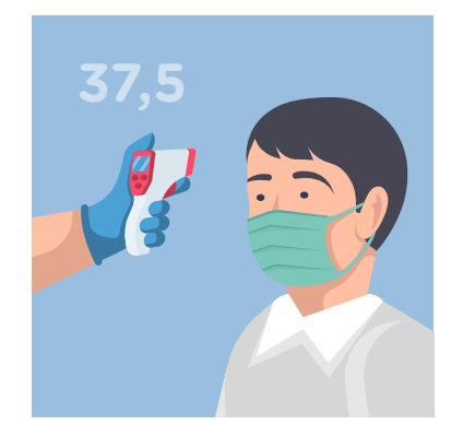
If the temperature is > 37.5°C, he/she is not permitted to enter the church