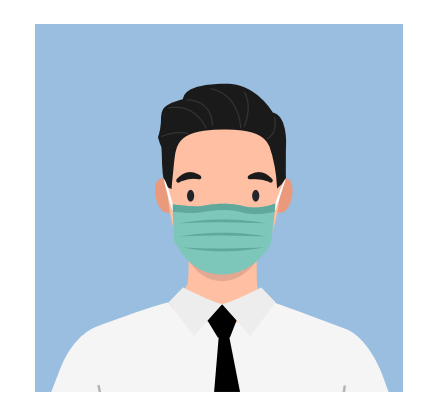
Wear a mask that covers the nose and mouth