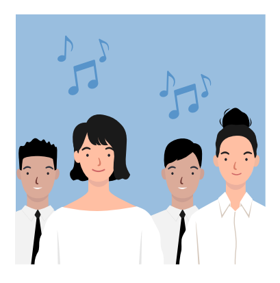
Choir presentation are limited by a maximum of 4 participants, without wearing masks